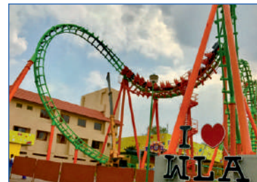
Wonderla Theme Park