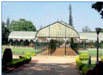
Lalbagh Botanical Garden